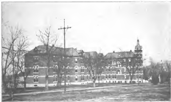
TOPEKA STATE HOSPITAL.